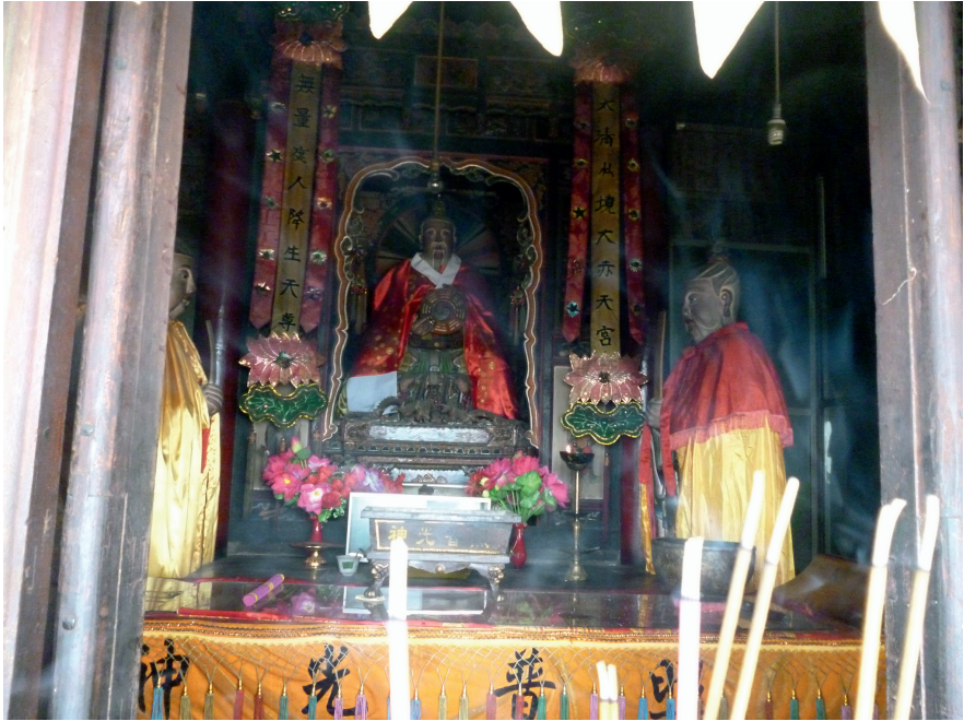
Illustration 2: Statue of the Laojun in Taishang lou temple on Kongtong shan.

himself “revealer” as he could read the thoughts of the ex-Taoist and exposed the “disbelief” which continued to influence the proselyte. 166