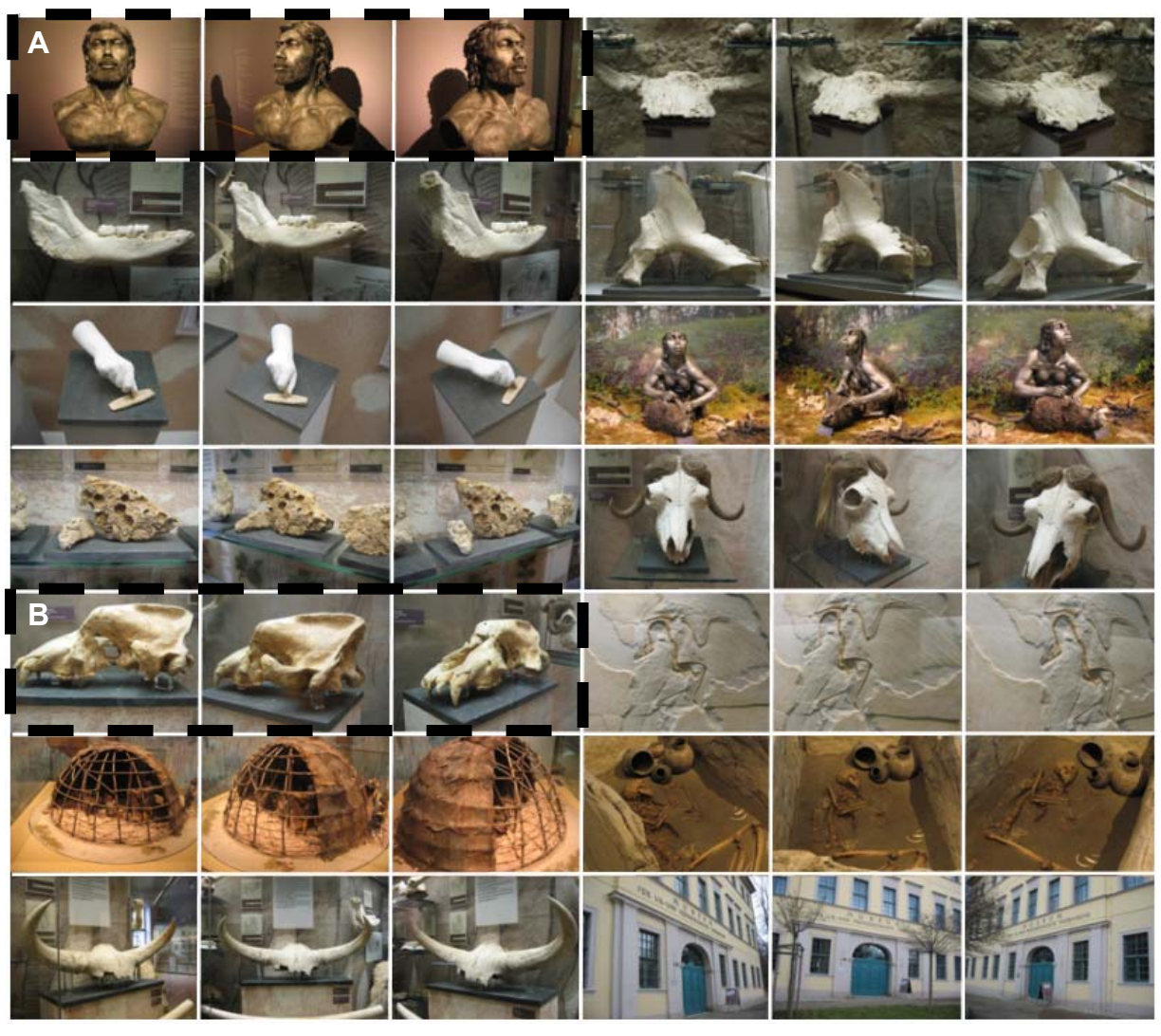
Figure 4. Fourteen representative test objects from three perspectives.

in relation to each other. The indicated different perspectives have been superimposed and appear in different gray scales in figure 2. The numbering equals the indexing used in this section. Their efficiency will be discussed in section 5.