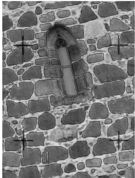
Fig.3: Automatically extracted stones

One of the major problems are the requirements for good initial values. If the surface of the object is nearly planar, they can be calculated by simple techniques like image pyramids. If the surface of the object is not plain, but contains large differences in the object distances and discontinuities there will be insufficient initial values. Solutions for this problems are semi-automatic approaches. Here it is necessary to support the matching process by a human operator who provides an initial point and a maximum parallax value. Using this technique the matching will stop at the borders of touched surface. An other possible solution is the use of more geometric or radiometric parameters and topological relationships, especially for the assignment of the corresponding interest points in the feature based approach.